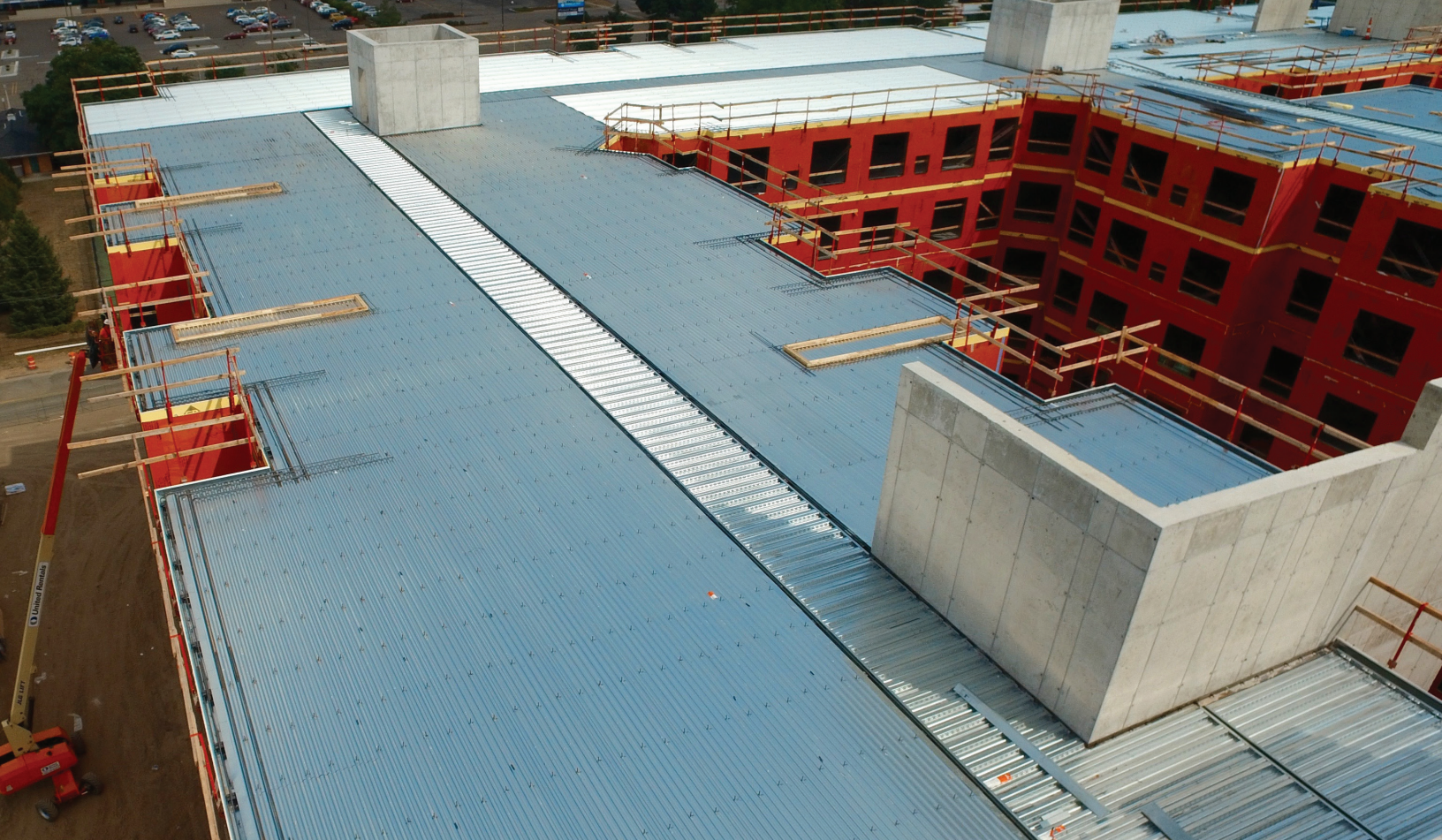
Ecospan joists span from the corridor wall to the building exterior.